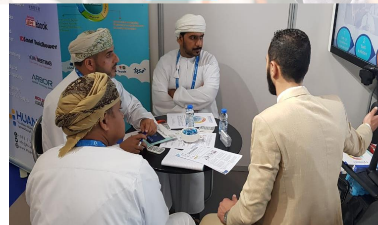
2017 GESS Dubai